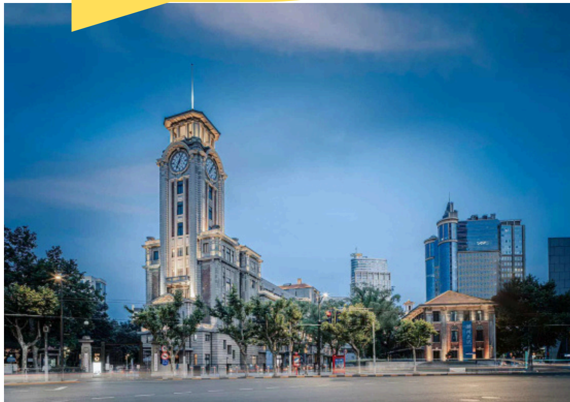
Shanghai History Museum

A 600-year-old site in a busy area of Shanghai, known for local snacks such as dim sum, vegetarian buns, and pigeon egg dumplings.