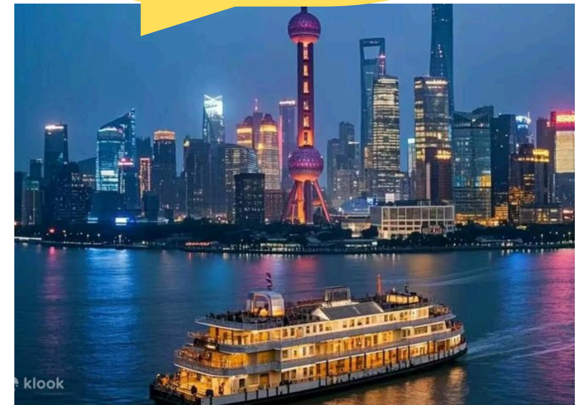
Bund Night Cruise

Take a night river cruise to enjoy Shanghai's stunning skyline, passing iconic sights such as the Bund and Lujiazui.