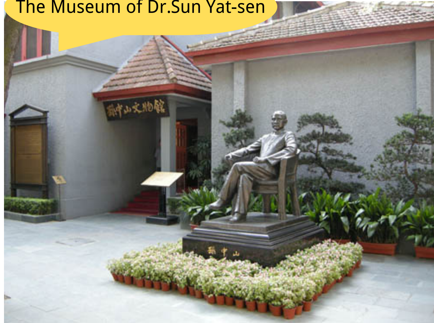
The Museum of Dr. Sun Yat-sen